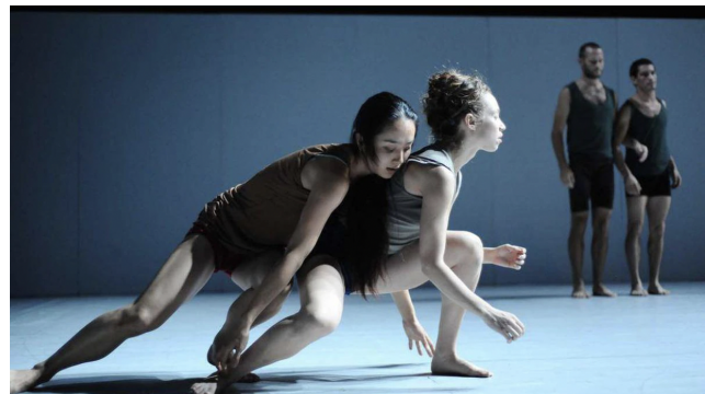
Batsheva Dance Company performs Sadeh21

"...dance is... a manifestation of a meaning through movement. [The dancer] does not show, he lives through. The dancer actually moves and is occupied with the act of forming precise physical textures and dynamics. Dancers articulate meaning by dancing. Articulation of movement is not an