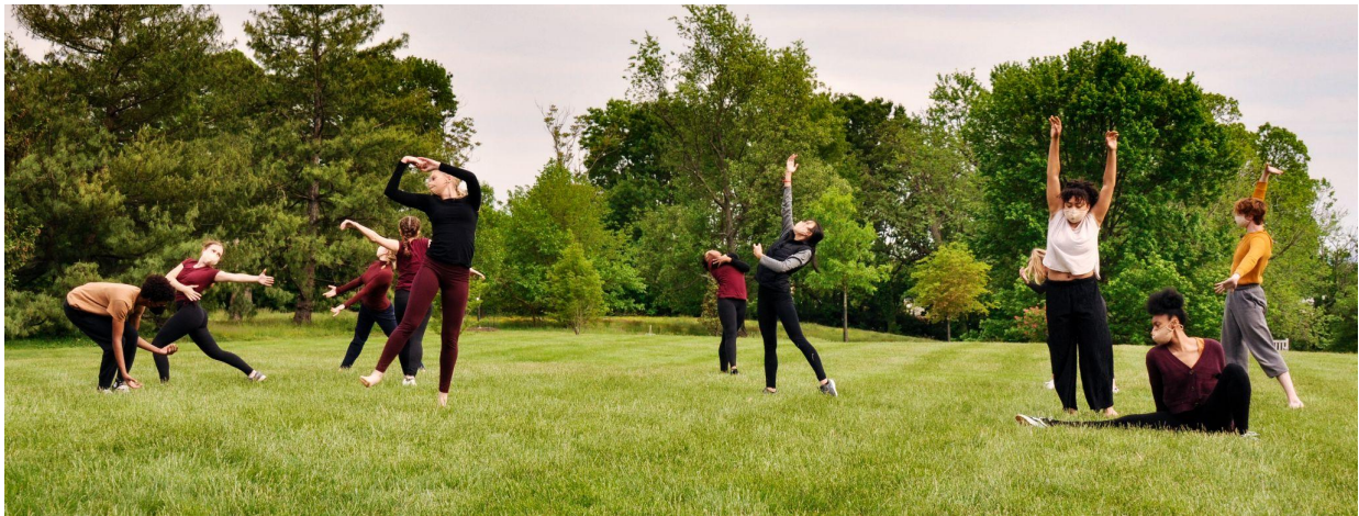
Performance of Spring Dance Concert 2021 ; Dancers: BSA Dance Class of '21